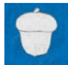
Treasurer Mike Crouch

We wish each of you smooth sailing and following seas and we wish to follow too.