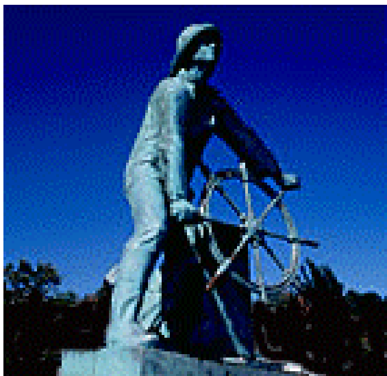
The Fishermen's Statue, Gloucester, Massachusetts

Editor's note: We had some fun with the movie The Perfect Storm on page one. But as most people know, the movie was based on a true story as recounted below in the Gloucester, MA newspapers. As a lot of people don't realize, fishermen have been dying for years out of Gloucester, Nova Scotia, the Bering Straits and indeed world wide. Out of respect for the men who risk and lose their lives so we may eat fish, we print this page.