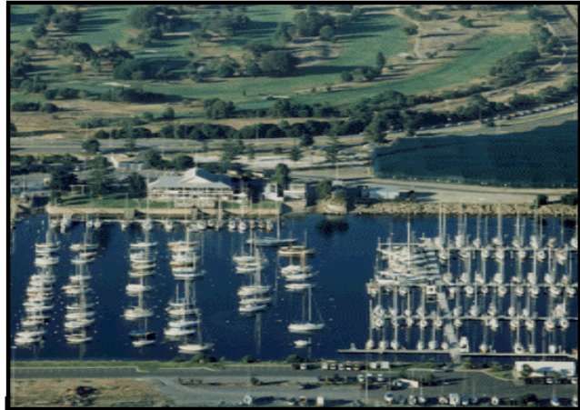
Royal South Australian Yacht Squadron "Home" for South Australian keelboat sailors since 1869

http://www.squadron.asn.au/ . From there, you can link to other Aussie sites, G'day.