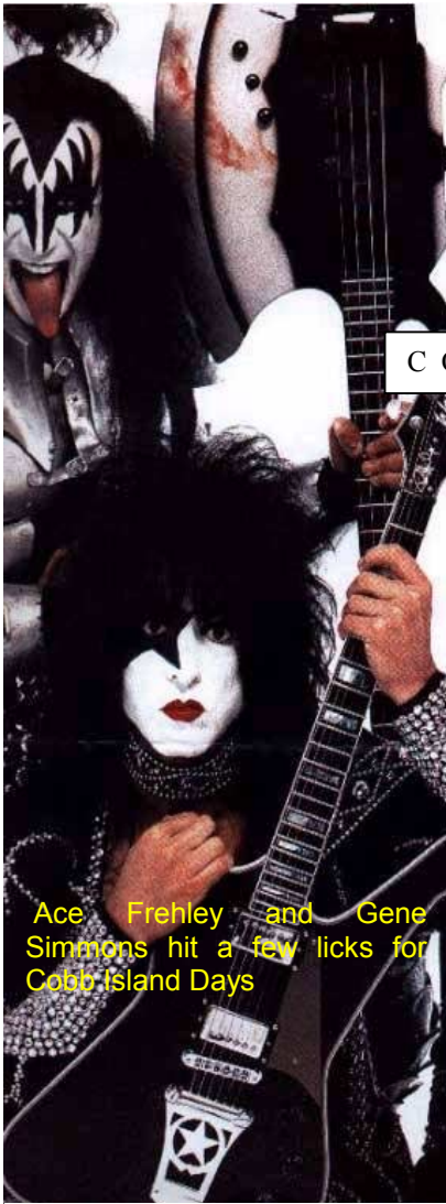
Ace Frehley and Gene Simmons hit a few licks for Cobb Island Days