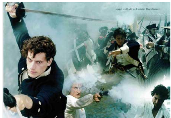
OK... OK... Hold that pig... right... there!

Horse-drawn wagon rides, fire engine rides, crab races, the corn-shucking contest, and other events that are both fun to participate in and fun to watch. Splice the mainbrace at Captain's Hour on Shymansky's Deck then stroll back across the bridge to work up an appetite. The day's final event is a pig roast at Fish Tales , followed by music and dancing. Sunday morning will be the usual great brunch buffet, at Shymansky's .