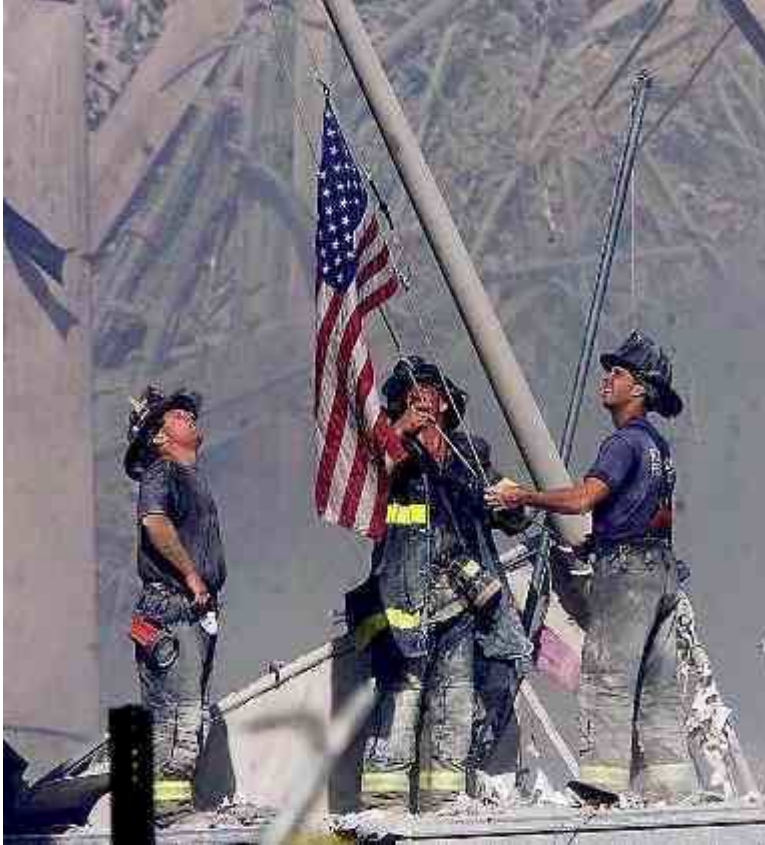
In a scene reminiscent of the marines raising the US Flag over Mount Suribachi on Iwo Jima during World War II, New York firemen establish a symbolic beachhead in lower Manhattan, site of the World Trade Center disaster.