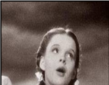
Oh, It'll be wonderful ToTo... Firemen Parading and Boats Parading and Carnivals...