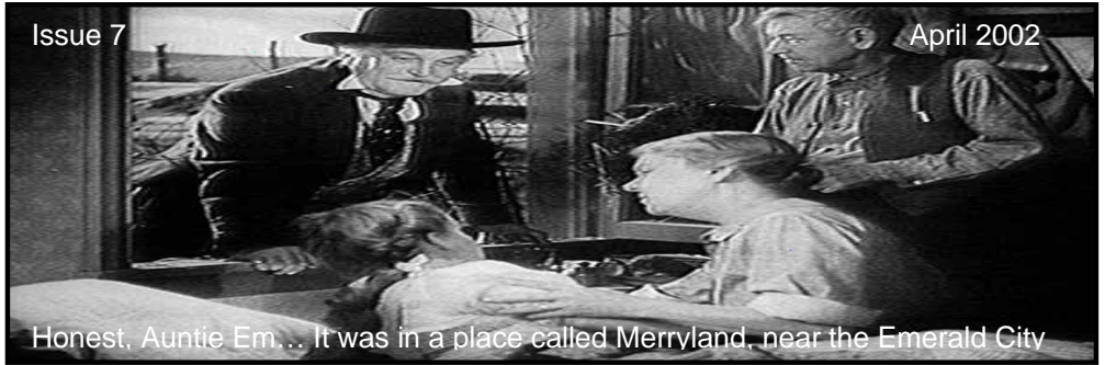
Honest, Auntie Em... It was in a place called Merryland, near the Emerald City