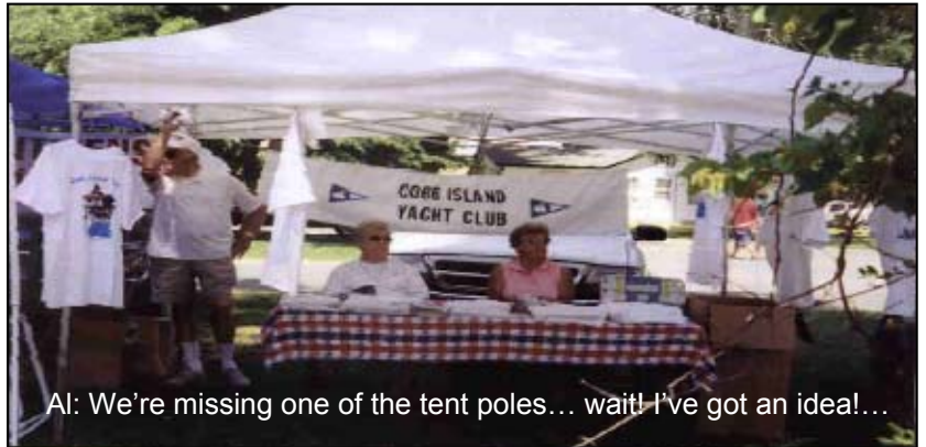
Al: We're missing one of the tent poles... wait! I've got an idea!...