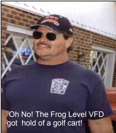
Oh No! The Frog Level VFD got hold of a golf cart!