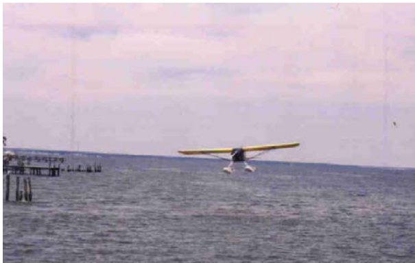
Winner in the Cessna Division. Some guy just flyin' by...

In spite of the fact that 55 boats were lost in the recent fire (see last month's issue), Colonial Yacht Club decided to keep its record of 50 Annual Boat Parades intact. As a result, they went forward with the 51 st Edition, inviting other local clubs to participate.