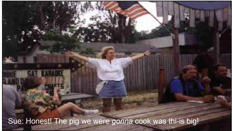
Sue: Honest! The pig we were gonna cook was thi-is big!